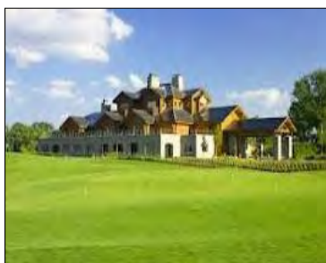
Lutterellstown Club House