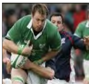
Eric Miller on the rampage for Ireland