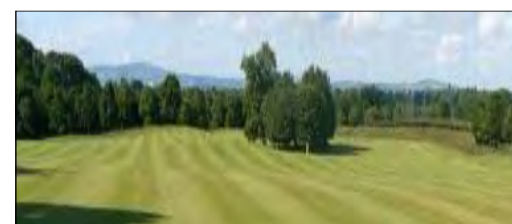
Fairway at Lutterellstown with the Dublin Mountains in the background