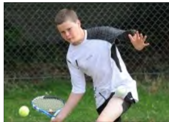
Practise makes perfect